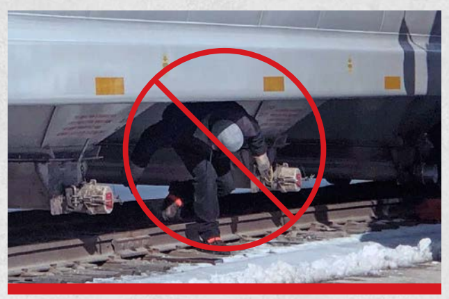
* Improves operator safety; lowering risk of accidents