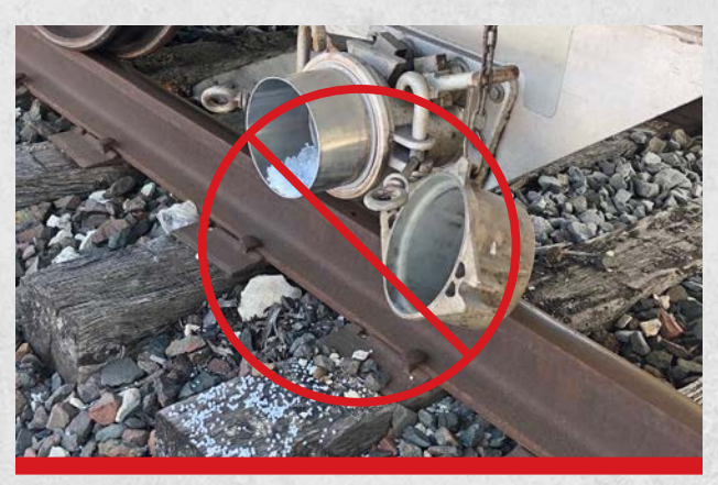
* Prevents pellet loss; reducing risk of fines